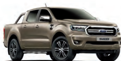
Diffused Silver Metallic body colour (Limited only)