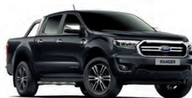
Agate Black Metallic body colour