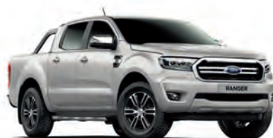
Moondust Silver Metallic body colour (Limited only)