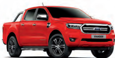
Race Red Solid body colour