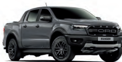
Conquer Grey Metallic body colour (Raptor only)