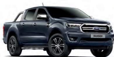
Sea Grey Metallic body colour (Limited only)