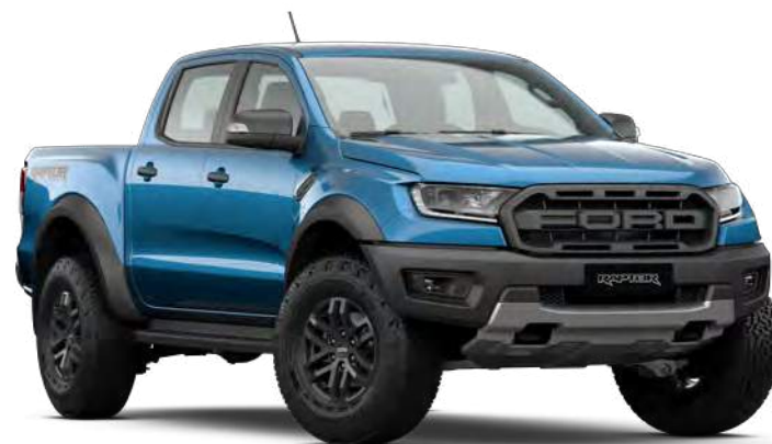
Performance Blue Metallic body colour (Raptor only)