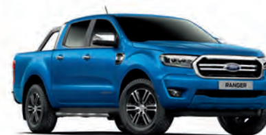
Blue Lightning Metallic body colour (Limited only)