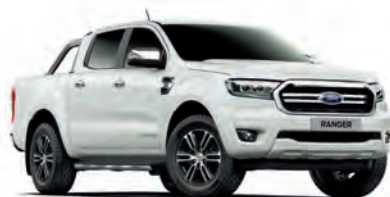
Frozen White Solid body colour